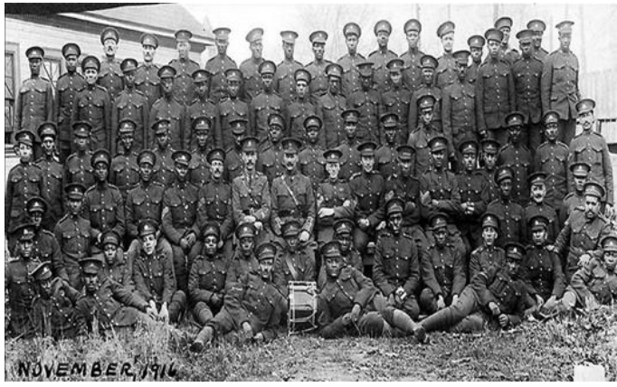
(Members of No. 2 Construction Battalion)

It was only after two years and the hard work of Black community leaders to challenge the racist and discriminatory recruitment policies, that No. 2 Construction Battalion was formed. The battalion played an invaluable role in the war by supplying critical lumber to the trenches and railways.