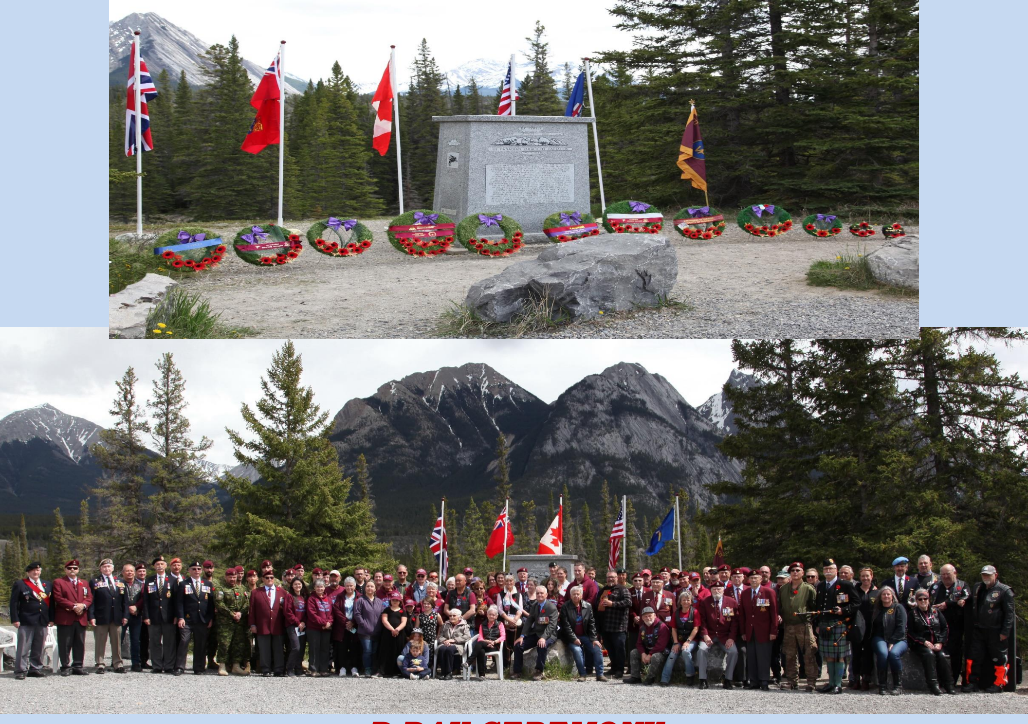
D-DAY CEREMONY SIFFLEUR FALLS, ALBERTA - JUNE 6<sup>TH</sup>, 2022