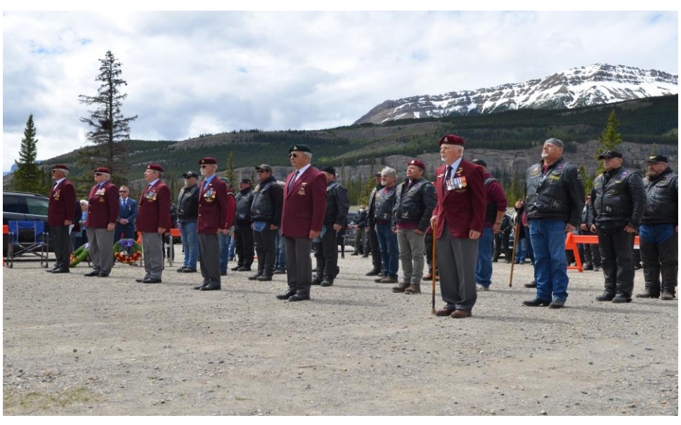
Parade formed in "social distancing" formation