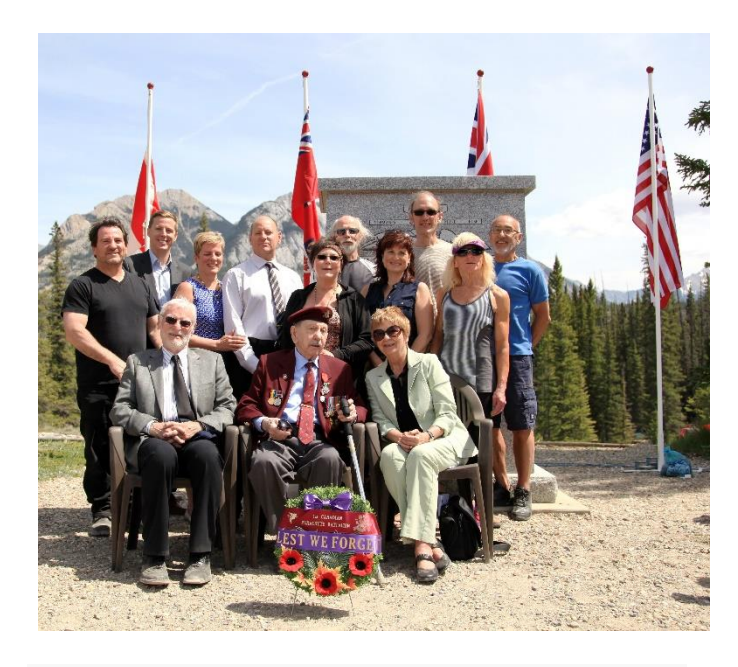
A Celebration of Life Ceremony to follow when COVID restrictions ease.

He was humble, generous, loving, wise, and much beloved by his extended family and friends.